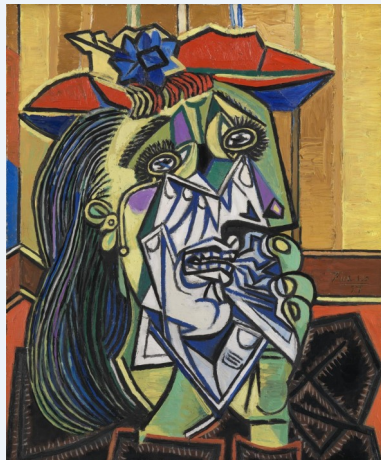
The Weeping Woman, by Pablo Picasso.

Picasso painted the Weeping Woman in 1937. The painting represents extreme sadness. It is an example of how artists use their work to show feelings. Picasso was trying to show what pain and sadness feels like.