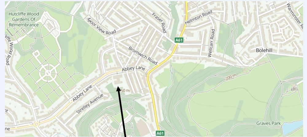
This map shows the area around our school.