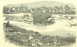
This print demonstrates the extent and impact of the Great Sheffield Flood (1864).