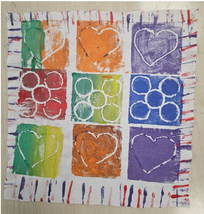
Art- Adinkra printing

In Geography this half term, we have been looking at our coasts. We have focused on the features of coasts, erosion and different types of weathering. We also used our coast learning when we visited Bempton Cliffs for our recent school trip, where we looked for birds and looked at the erosion of the cliff edge. It was brilliant!